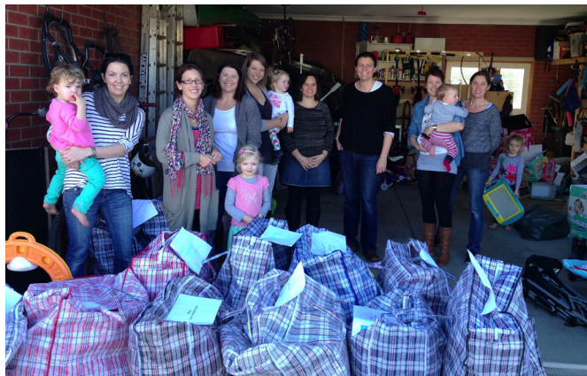
The G-Team - volunteers and committee members of Geelong Mums

We have quickly developed a large network of supporters including 1500 plus Facebook followers, 70 volunteers and have held seven collection events with more than 200 individuals donating goods.